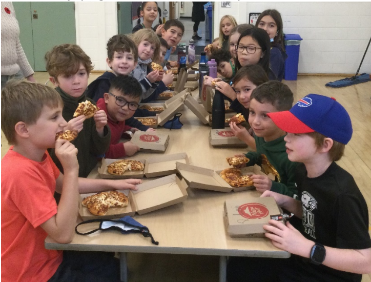
Grade 2 enjoying their Pizza Hut lunch prize